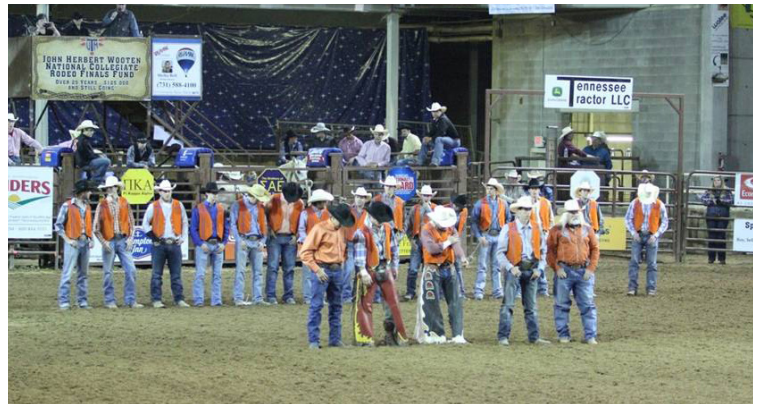
Bottom: UTM Men's team is honored for their 2014 National Team Title before the Saturday Night Performance of the 47th Annual UTM Rodeo.