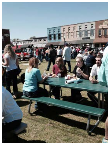
Right: Folks enjoying the free BBQ at the Booster Club's live auction sponsored by Edward Jones.