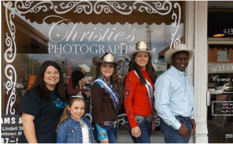
Christie's Photography was the Window Decoration winner, sponsored by the Martin Business Association.