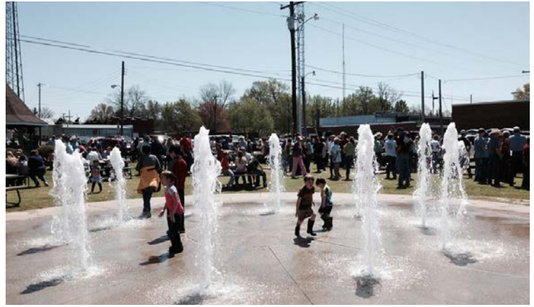
Enjoying a beautiful day in downtown Martin at the Rodeo Booster's Scholarship Auction.