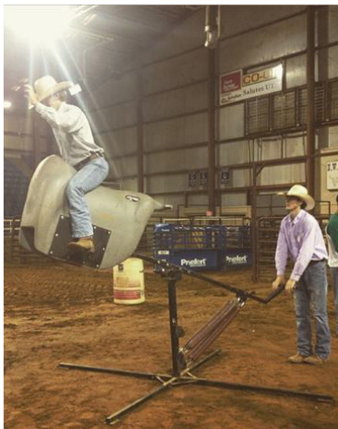
Left: Working on correct technique during the Sankey Rodeo School.